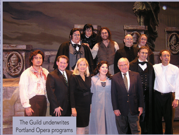
The Guild underwrites Portland Opera programs