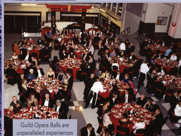
Guild Opera Balls are unparalleled experiences