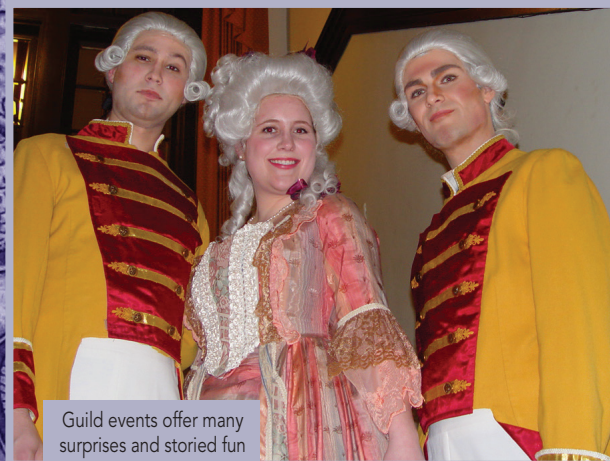
Guild events offer many surprises and storied fun