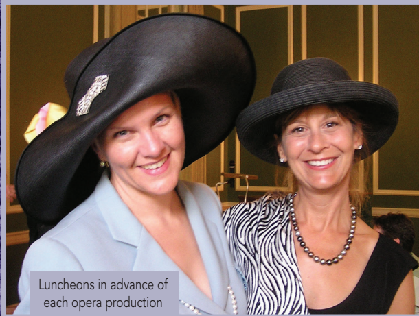
Luncheons in advance of each opera production